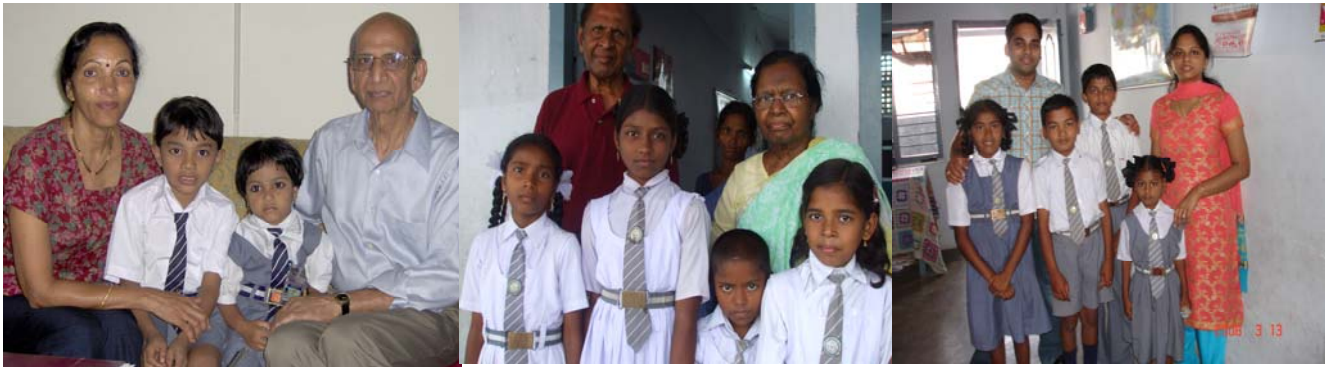
Sponsor: Hope for Humanity From: College Park, Maryland Visited their children in Vizag

We are thankful to many sponsors who took time to visit some of their sponsored children during their trip to India. It is a great feeling for the sponsors to actually see their sponsored children. We hope and encourage all our sponsors to visit their sponsored child one day.